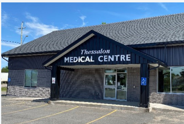
Thessalon Medical Centre