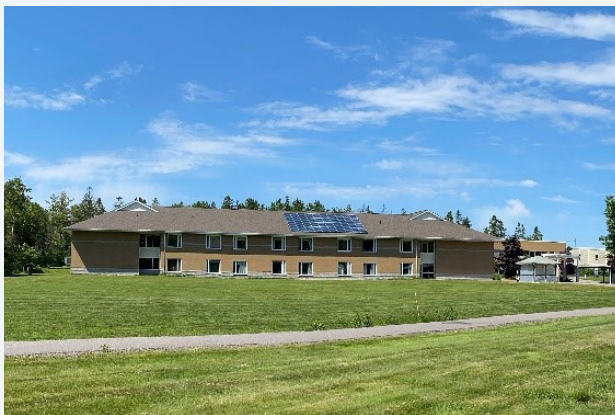
Algoma Manor Nursing Home