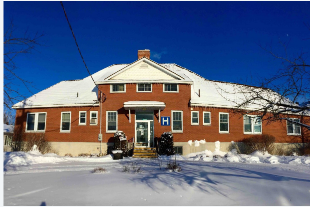
• Matthews Memorial Hospital