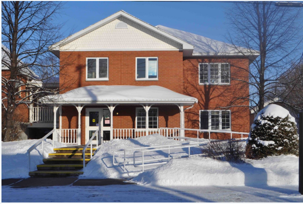
• BridgeLink Medical Centre