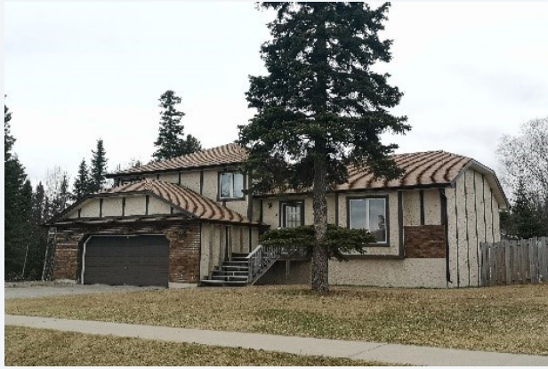
• Locum Accommodations