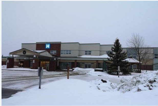
• Wilson Memorial General Hospital