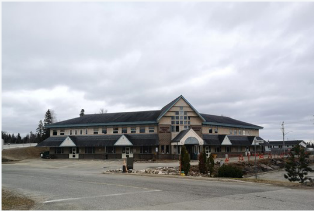
• Marathon Family Health Team Clinic