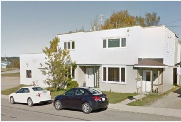
• Learner Accommodations