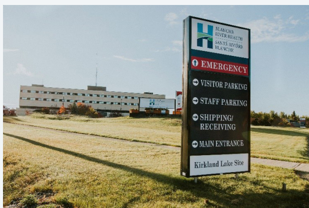
Blanche River Health