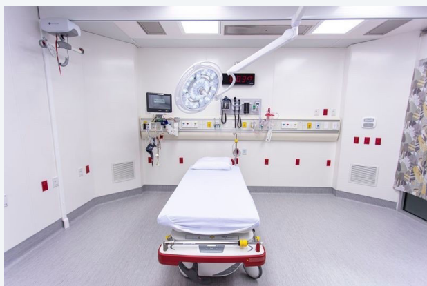
• Trauma Room