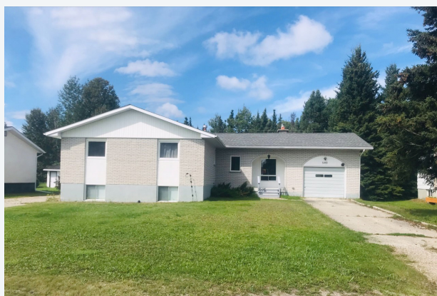
• Main Locum House