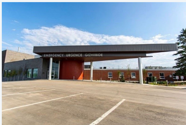
• Geraldton District Hospital Main Entrance