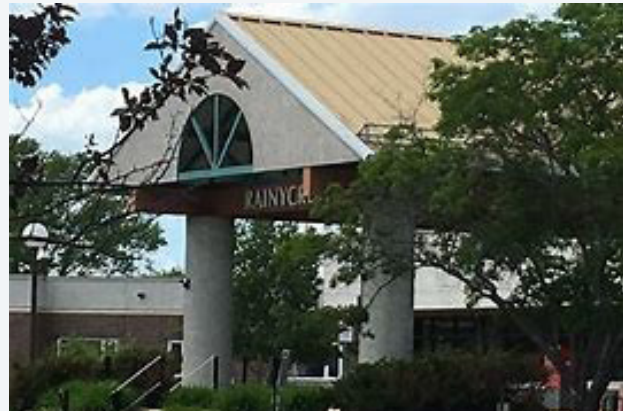
• Rainycrest Long Term Care Home