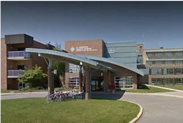
• La Verendrye Hospital