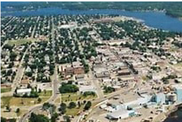
• Fort Frances