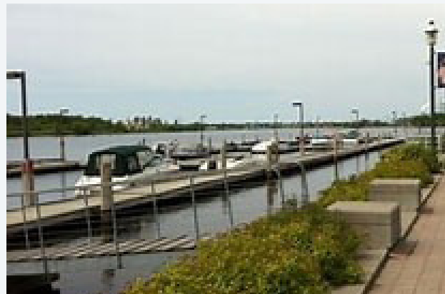
• Fort Frances Marina