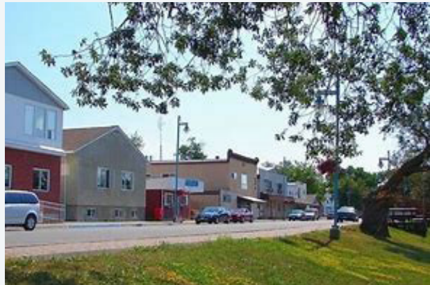
• Downtown Emo