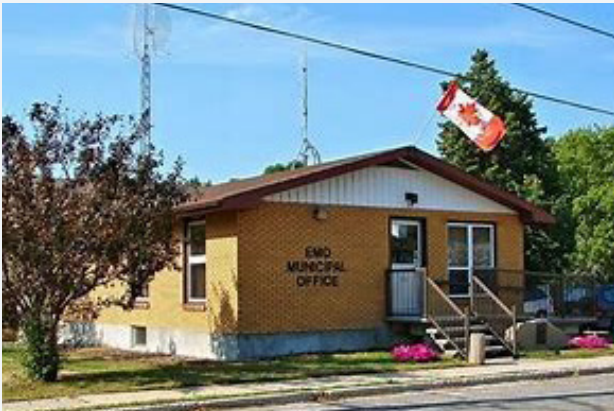
• Emo Municipal Office