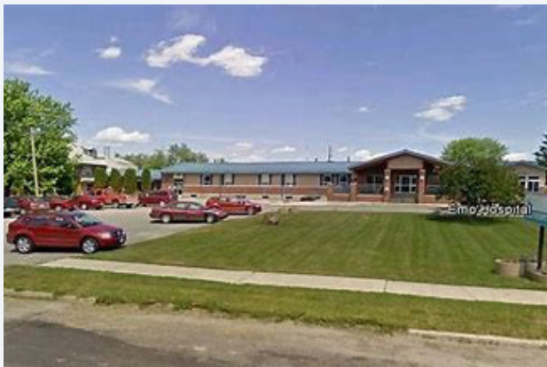
• Rainy River Health Centre