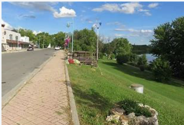
• Downtown Emo