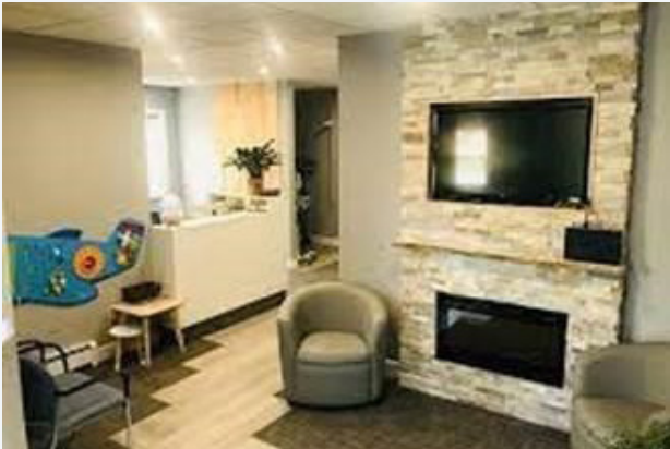
• Saari Medical Office