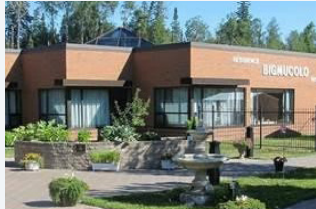
• Long Term Care Home