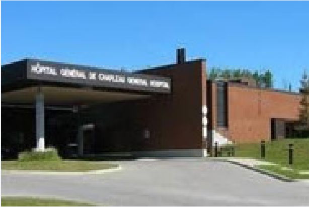
• Chapleau General Hospital