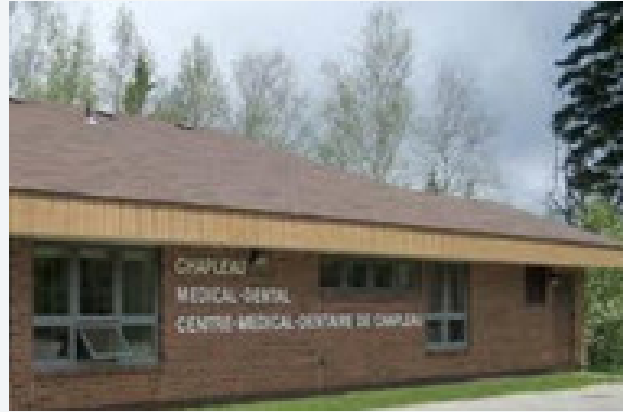
• Chapleau & District Family Health Team