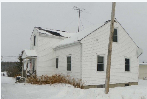
• BMH House