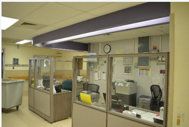
• Nursing Station