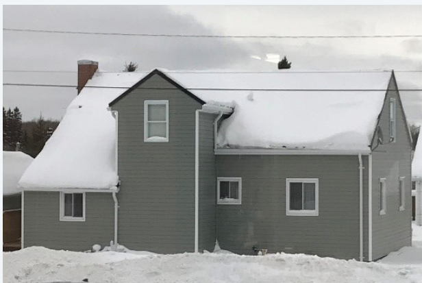
• BMH House