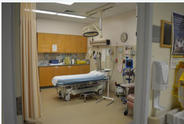
• Emergency Department