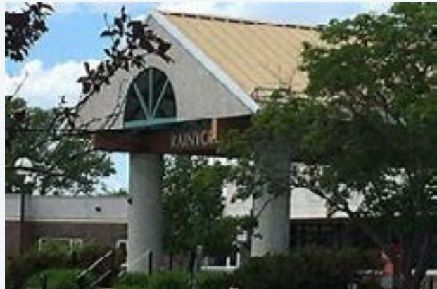
• Rainycrest Long Term Care Home