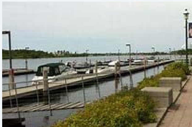
• Fort Frances Marina