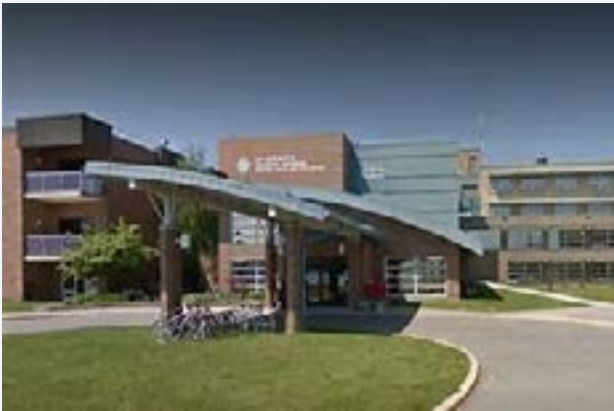
• La Verendrye Hospital