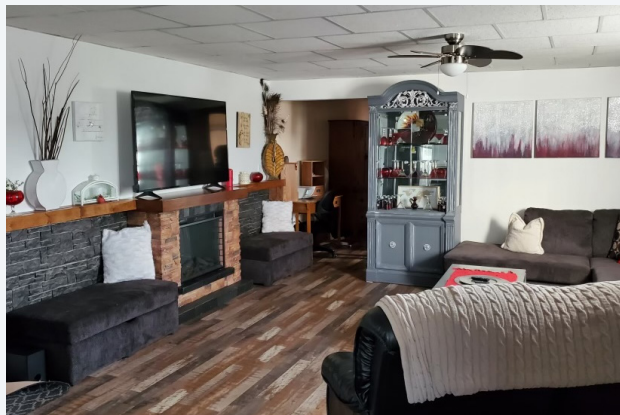
• Englehart Physician Accommodations