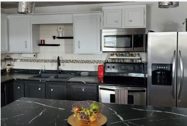
• Englehart Physician Accommodations