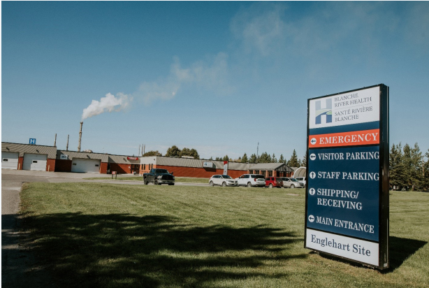
• Blanche River Health