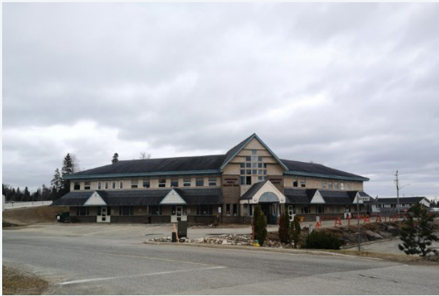
• Marathon Family Health Team Clinic