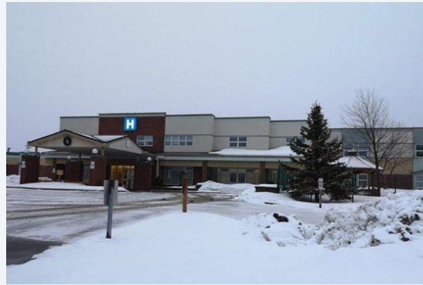
• Wilson Memorial General Hospital