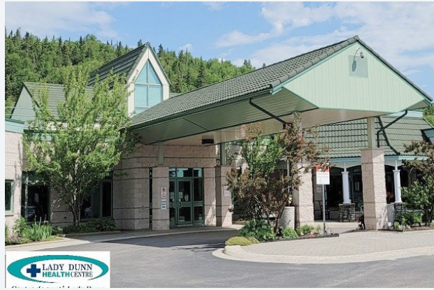
• Lady Dunn Health Centre