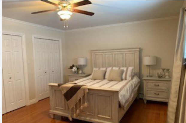
• Locum/learner housing