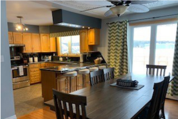
• Locum/learner housing