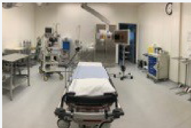
• Lady Dunn Health Centre