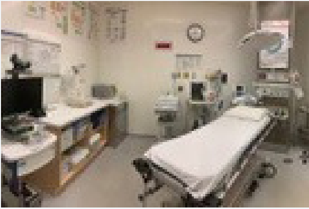
• Lady Dunn Health Centre