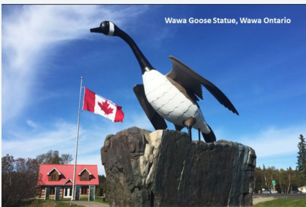
• Wawa goose