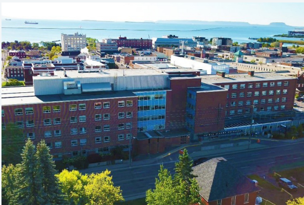
• St. Joseph's Hospital