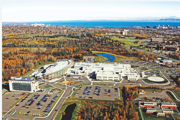
• Thunder Bay Regional Health Centre