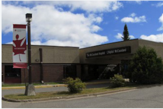
• McCausland Hospital