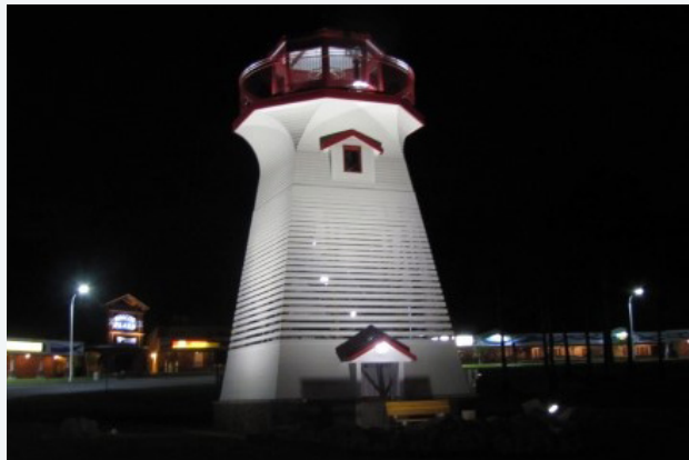
• Terrace Bay Lighthouse