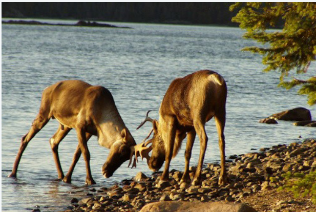
• Slate Island Caribou