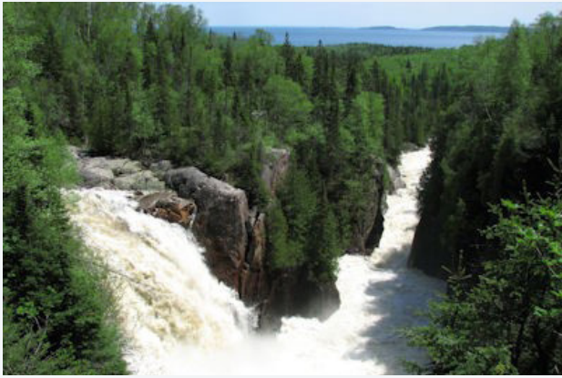
• Aguasabon Falls