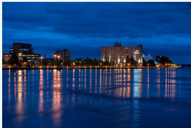
• Waterfront at Night