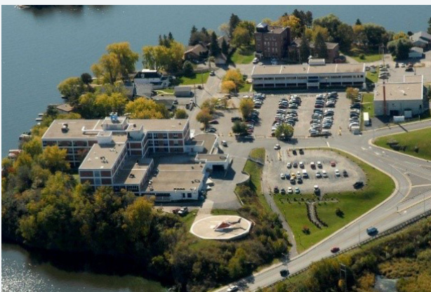
• Lake of the Woods District Hospital