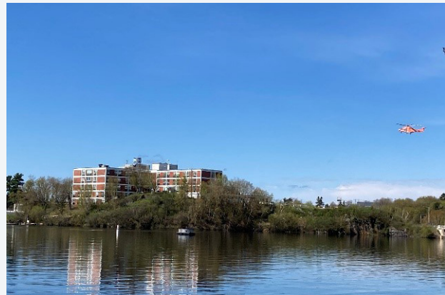
• Lake of the Woods District Hospital