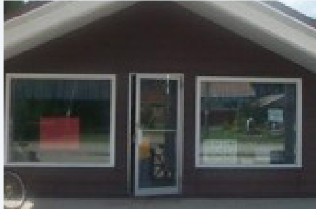
• Redemption Baptist Church