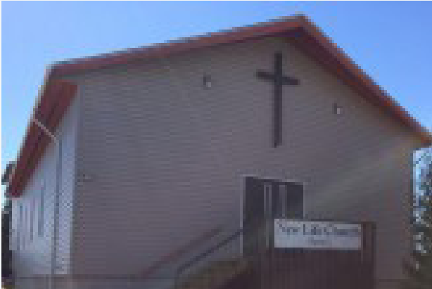
• New Life Church