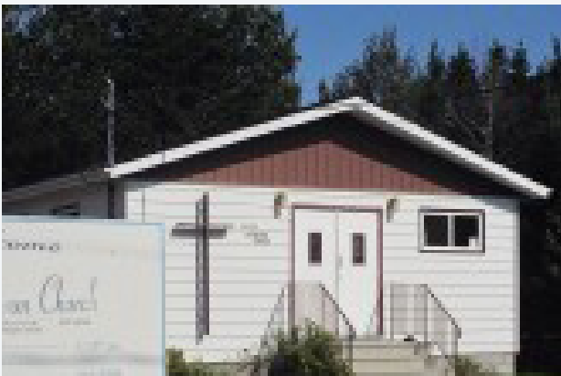
• Faith Lutheran Church