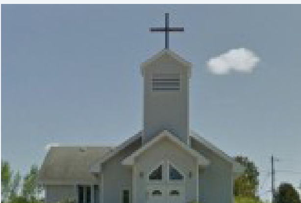
• Emmanuel Anglican/United Church