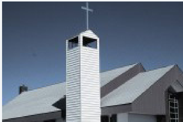
• Immaculate Conception Roman Catholic Church