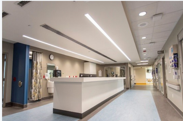
• ER-Physician and Nursing Station