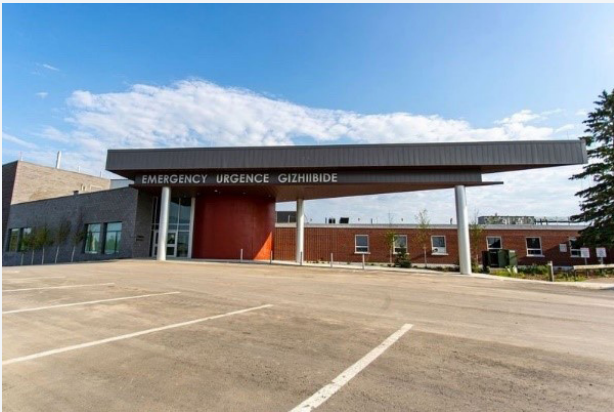
• Geraldton District Hospital Main Entrance