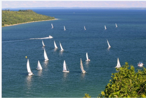
• Gore Bay