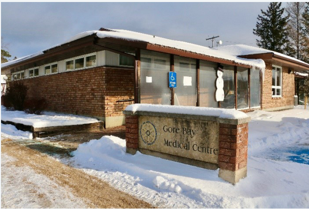
• Gore Bay Medical Centre