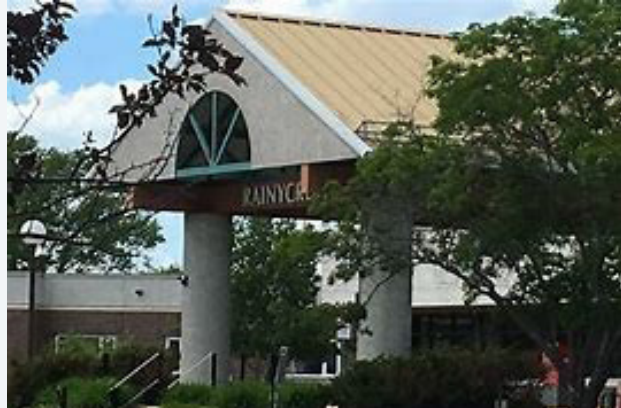
• Rainycrest Long Term Care Home