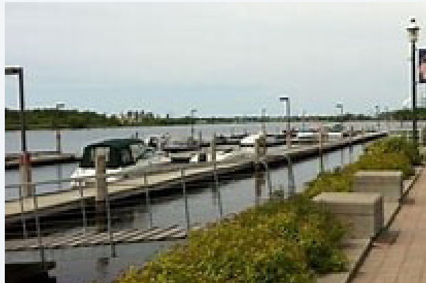
• Fort Frances Marina