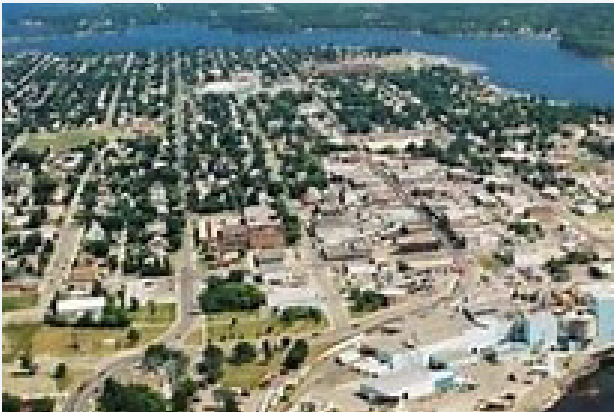
• Fort Frances