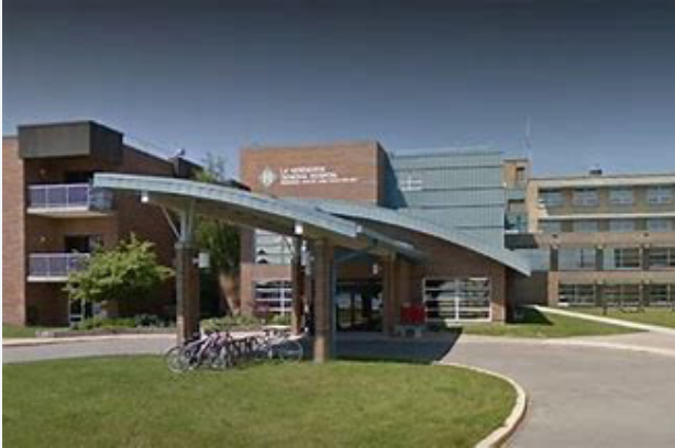
• La Verendrye Hospital