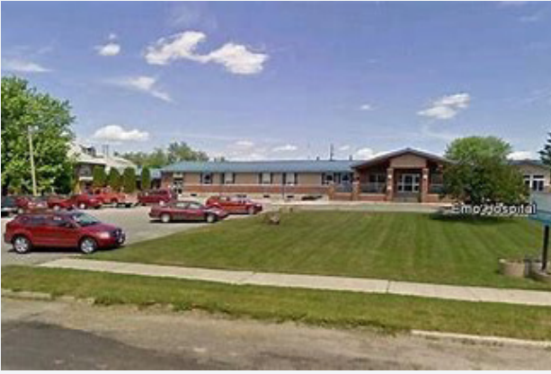
• Rainy River Health Centre