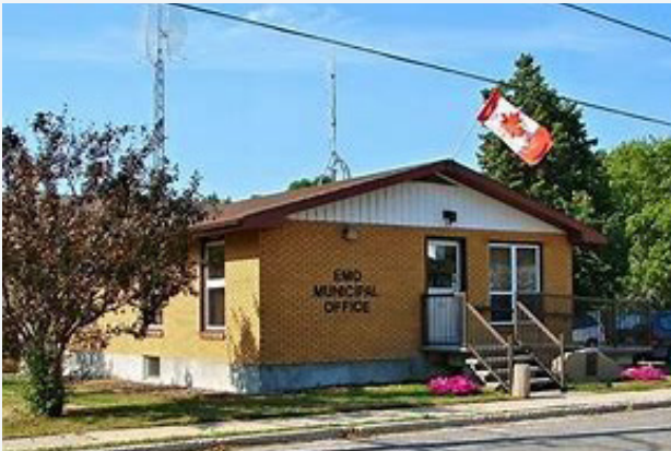
• Emo Municipal Office