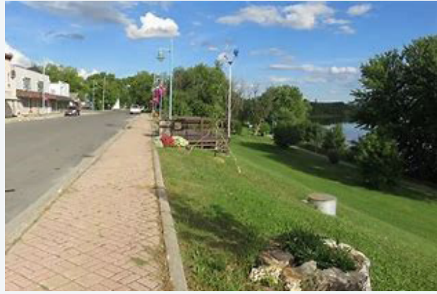
• Downtown Emo