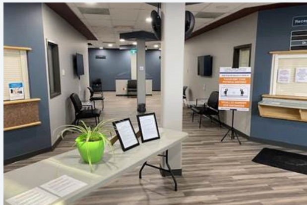
• Cochrane Family Health Team