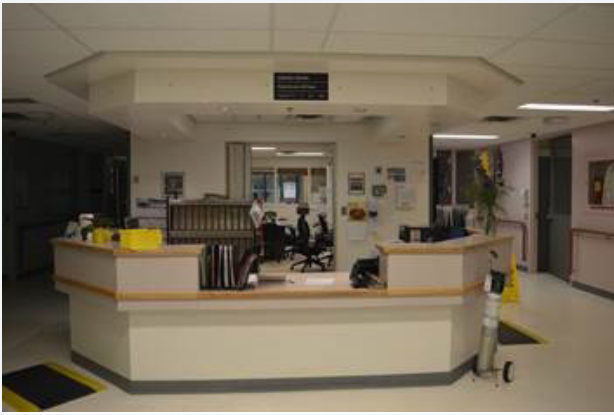
• Lady Minto Hospital