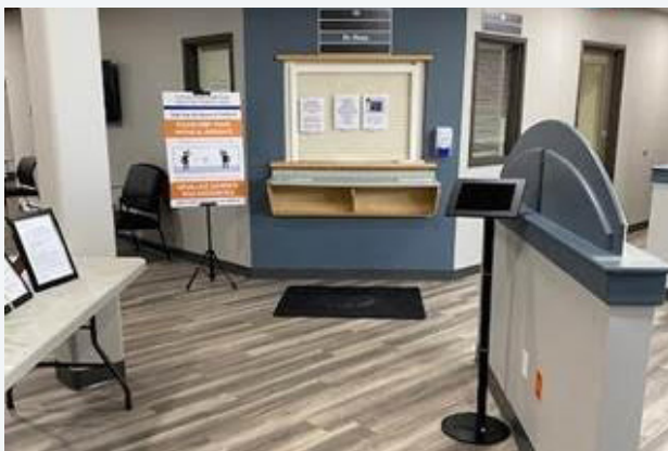
• Cochrane Family Health Team