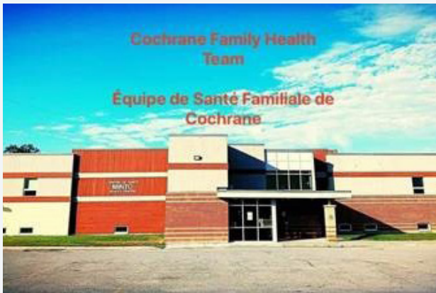
• Cochrane Family Health Team