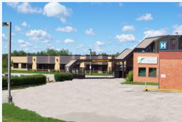
• Lady Minto Hospital