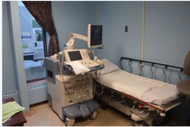
• Lady Minto Hospital