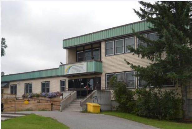
• Bingham Memorial Hospital

Please contact Abbigail for access to Matheson’s complete and comprehensive recruitment information package, including practice descriptions, remuneration, incentives, recreational opportunities and much more.