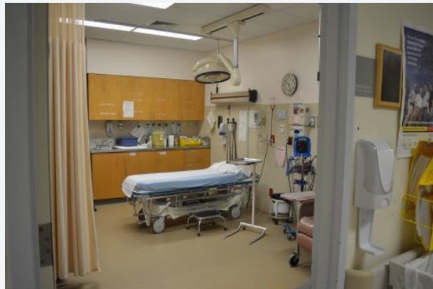
• Nursing station