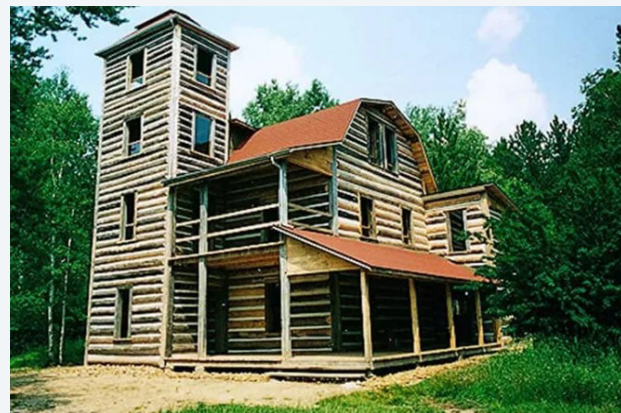
• The White Otter Castle