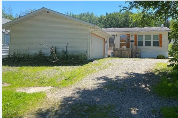
• Locum House