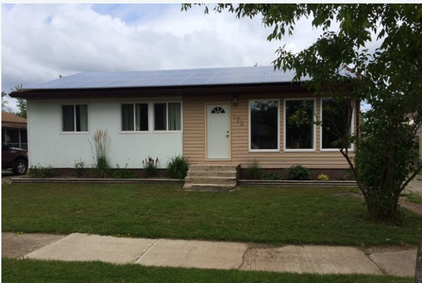
• Locum House