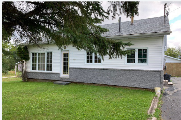
• NOSM U Learner House