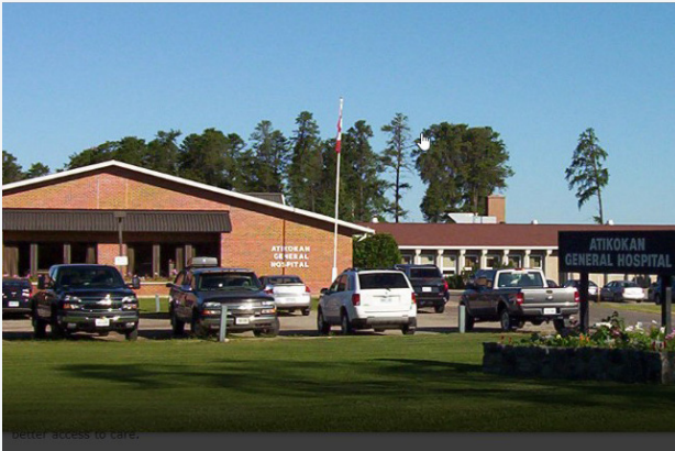
• Atikokan General Hospital