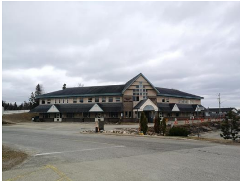
Marathon Family Health Team Clinic