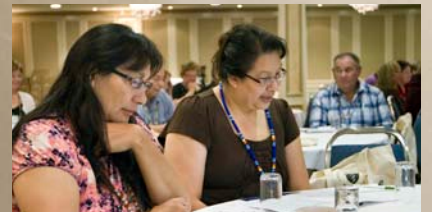
Participants provide feedback to NOSM.