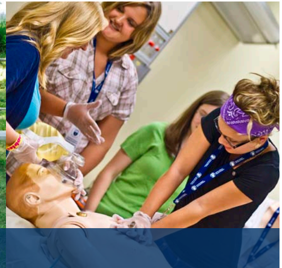
Participants et organisateurs du camp estival des sciences de la santé de l'EMNO. NOSM Summer Health Sciences Camp participants and organizers.

Cette année, 38 élèves de villes de tout le Nord de l'Ontario ont participé aux camps. Ils ont eu diverses activités pratiques liées aux soins comme l'installation d'un plâtre, la résolution d'un cas de criminalistique et de la chirurgie générale. Ils se sont informés sur les médecines traditionnelles et ont appris comment se préparer à faire carrière dans la santé.