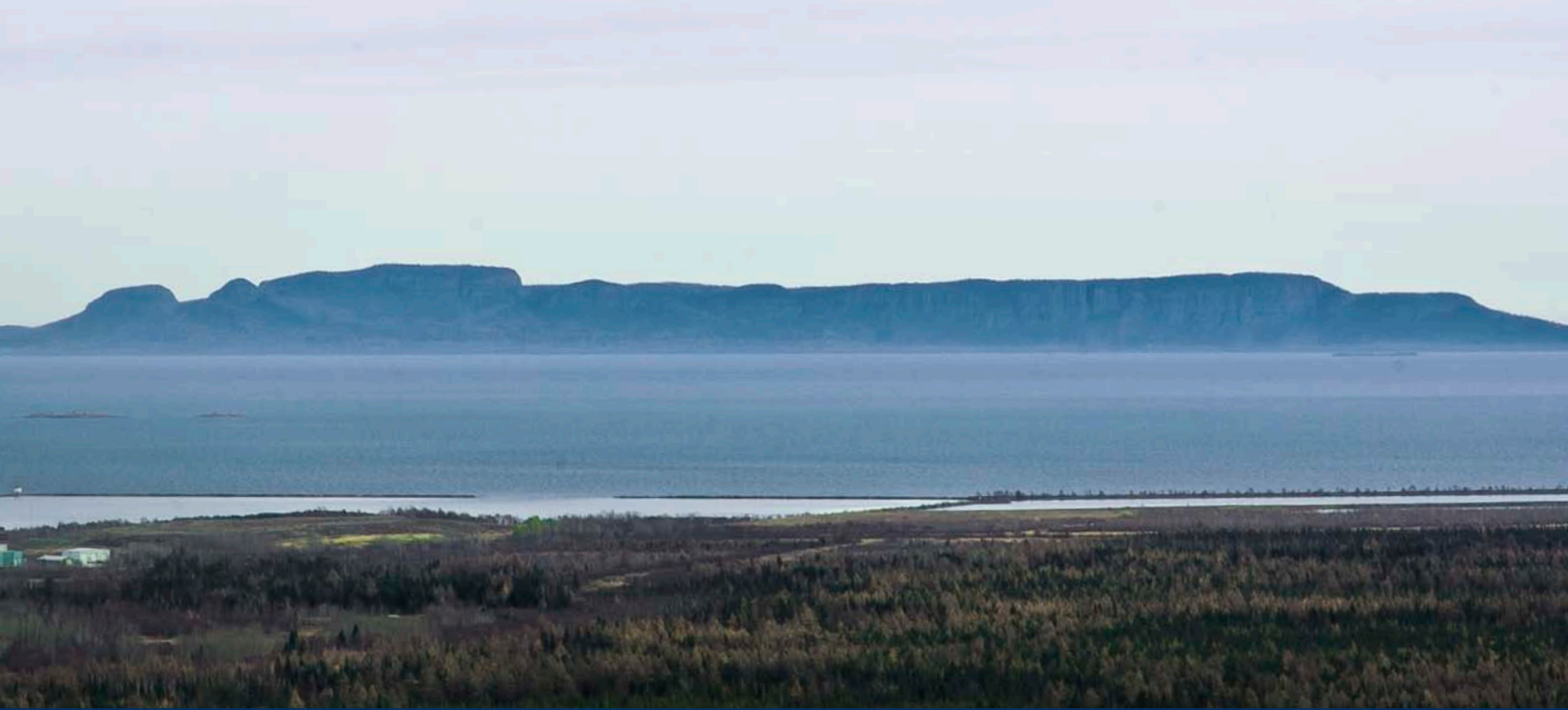
The Sleeping Giant, Thunder Bay, Ontario.