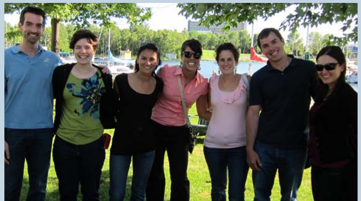
NOSM residents who participated in the 2011 Resident Orientation sessions at the East Campus.

On June 29 and 30, NOSM's Postgraduate Education portfolio held its 2011 Resident Orientation sessions at the East and West Campuses. NOSM's newest residents in postgraduate training programs were introduced to the School and its resources. Not only was the event an opportunity to meet and greet, but residents were also treated to a little bit of Northern Ontario hospitality. West Campus residents gathered for breakfast at the storied Hoito restaurant in Thunder Bay, and East Campus residents visited the Sudbury Yacht Club. NOSM is accredited for residents training in Family Medicine, Family Medicine enhanced, Public Health & Preventive Medicine, General Surgery, Internal Medicine, Pediatrics, and Orthopedic Surgery.