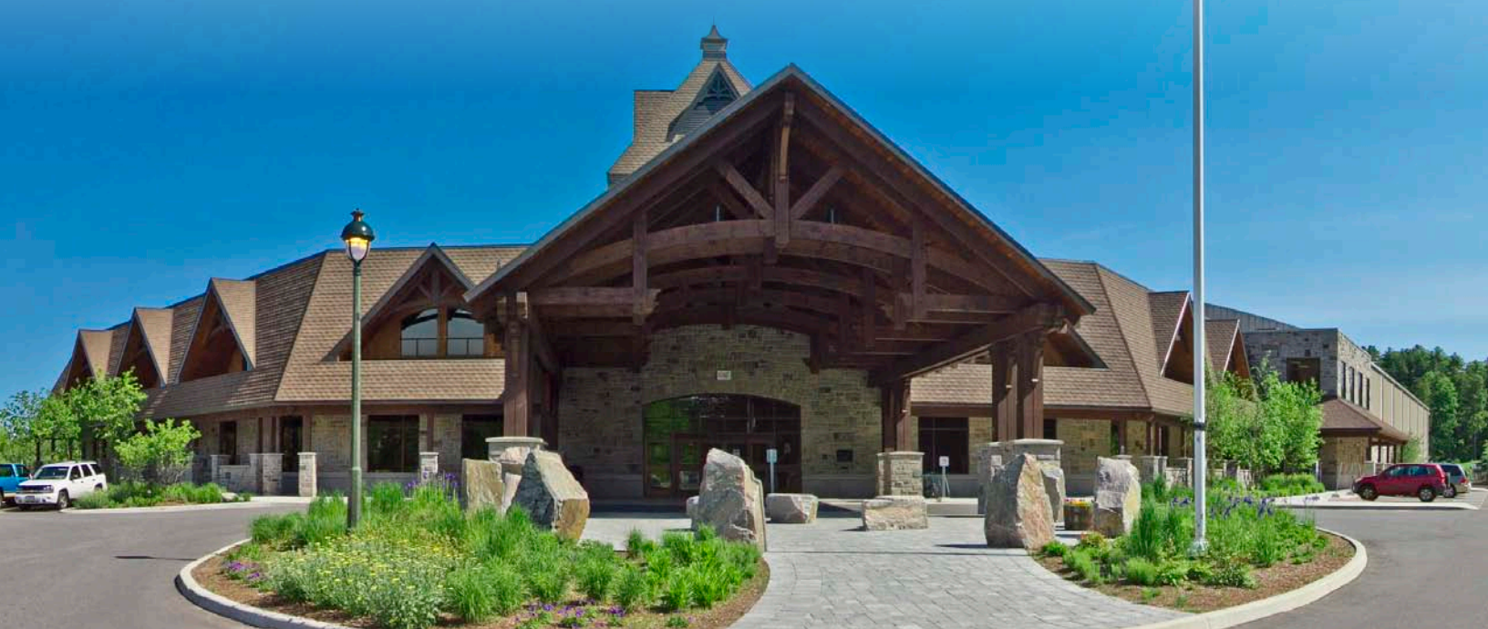
NHRC hosted at the Centennial Centre expansion, now known as the Canada Summit Centre in Huntsville, Ontario.