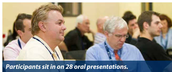
Participants sit in on 28 oral presentations.

Next year, the NHRC will be held in Thunder Bay, in conjunction with the 2012 Canadian Oxidative Stress Consortium (COSC) Conference.