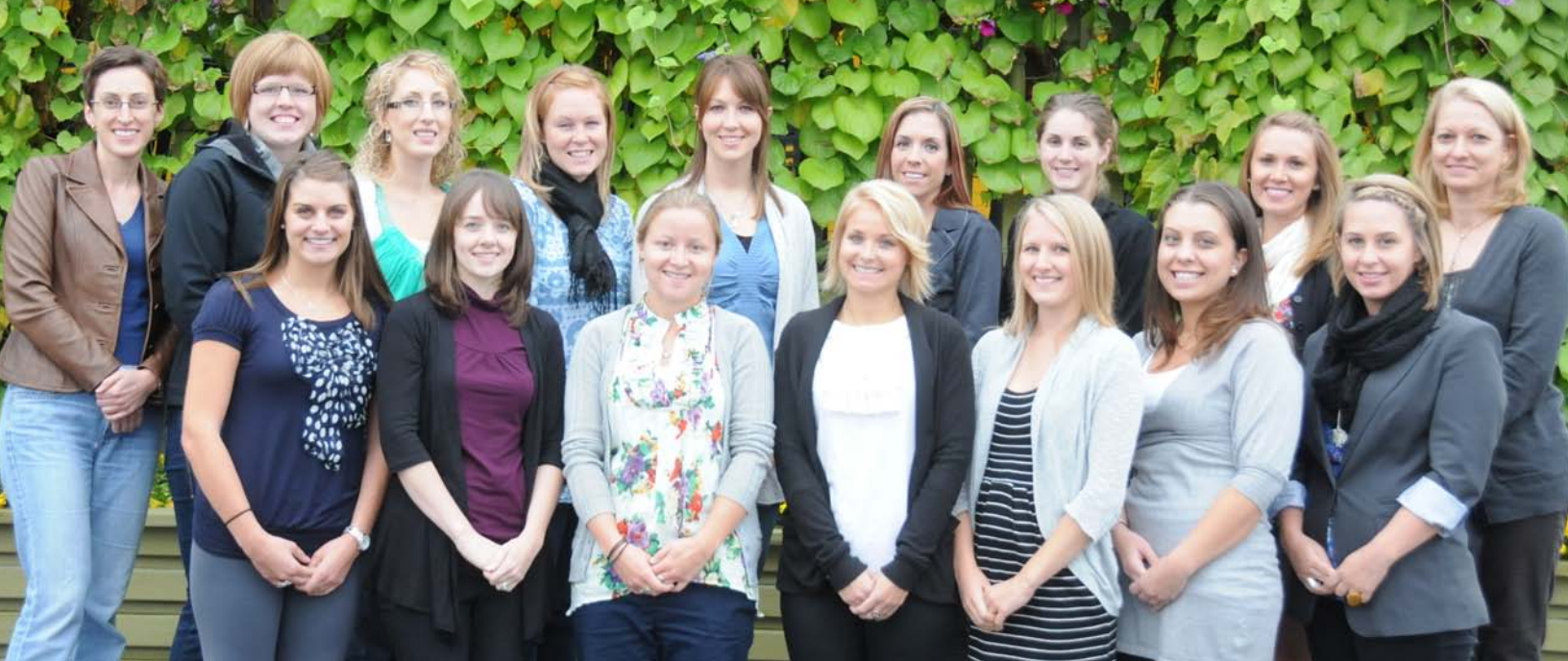
The 2011 Graduates of the Northern Ontario Dietetic Internship Program.