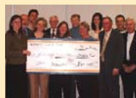
The Sudbury Credit Union presenting their generous donation of $50,000.