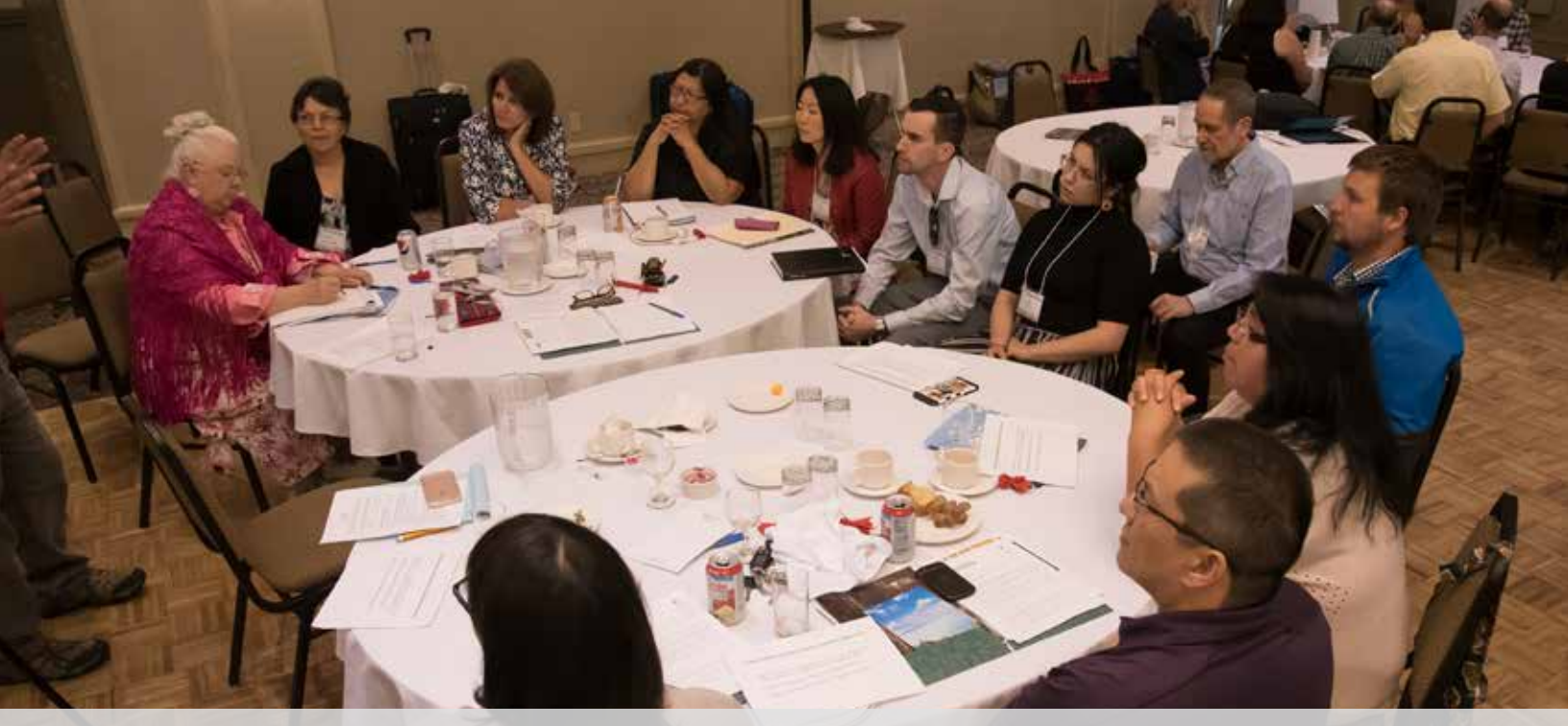
The World Café provided an opportunity for participants to share challenges, success stories, and ways forward.

The role of prevention and making physical environments safe (e.g., clean drinking water) were also prominent topics. To create brighter futures, it is necessary to provide recreational and landbased activities, the right to play and family well-being programs, which will promote healthy lifestyles with equal value on Indigenous and non-Indigenous populations.