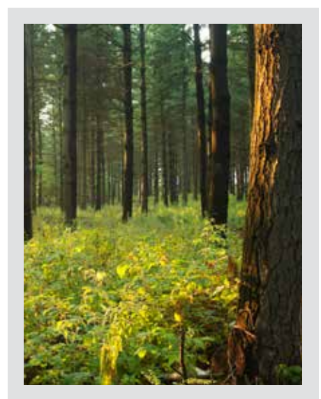
It has been well documented that suicide rates in Indigenous peoples in Canada are higher than the general population.

Every Indigenous generation has their challenges; past generations have survived devastating traumas as a result of residential schools, the Sixties Scoop, the Indian Act, loss of identity, Bill C-31, alcohol and substance abuse, loss of language, and loss and forced removal of land base, etc. This generation is faced with the trauma of high rates of suicide, especially among children and youth.