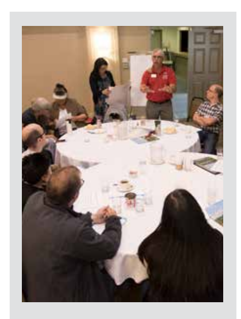
Recognize and respect diversity in communities and between communities.

Suicide is a reality for Indigenous Peoples. It has been well documented that suicide rates are higher in Indigenous communities compared to the general population of Canada. While some communities have not experienced suicide for the last several years, too many communities have much higher rates of suicide than those found in non-Indigenous communities. It is estimated that in Canada the rate of suicide among First Nation's youth is five to seven times that of non-Indigenous youth. Numerous reports and policies have been drafted with recommendations on how to deal with suicide in Indigenous communities and yet many communities still face the trauma of suicide as a regular occurrence.