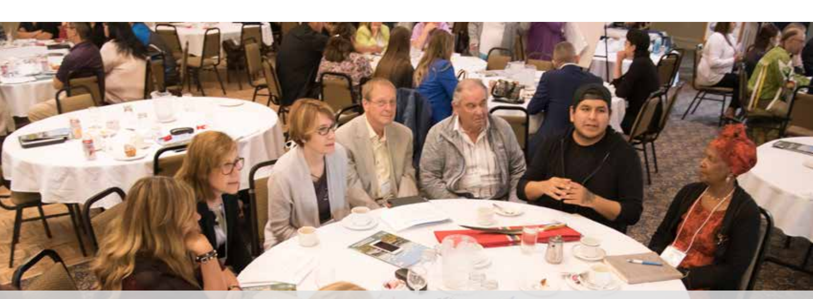
Pathways to Well-Being workshop participants stressed that it is important for young people to know who they are, their nations, names, clans and rites of passage.

It was also the intent that the workshop would provide an opportunity to identify volunteers to participate in a Pathways to Well-Being Steering Committee, with representation from across the region, in particular Indigenous youth, community leaders and Elders. The aim of the Steering Committee would be to develop an action plan from the workshop recommendations, including a timeline, indicating immediate, short and long-term goals, to consider strategies to build on community strengths and promote life and life skills. NOSM's Indigenous Affairs Unit and Research Portfolio would provide the initial administrative support for this Steering Committee, but the committee would be expected to seek funding for a five-year plan to sustain its activities.