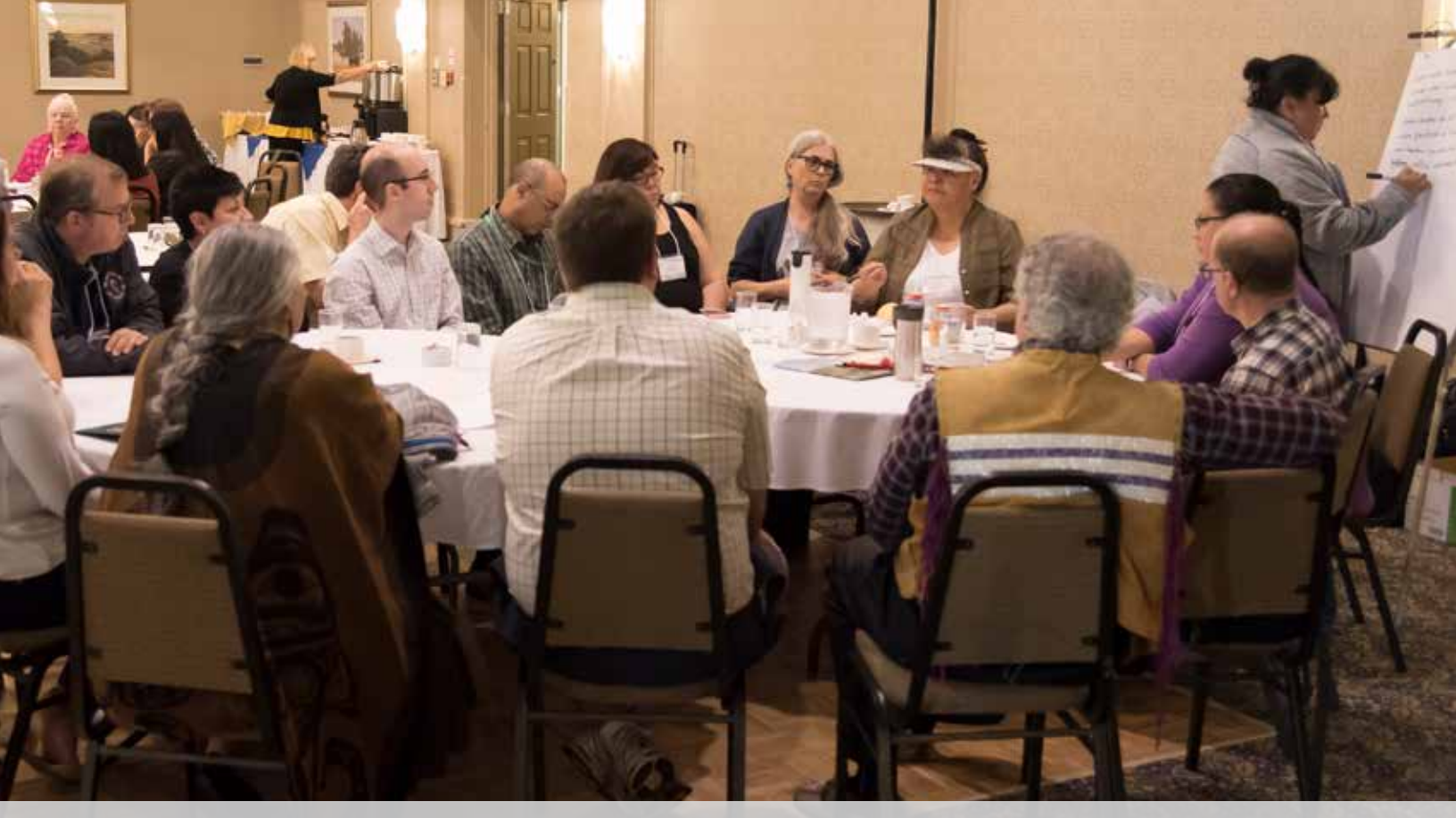
The World Café provided an opportunity for participants to share challenges, success stories, and ways forward.